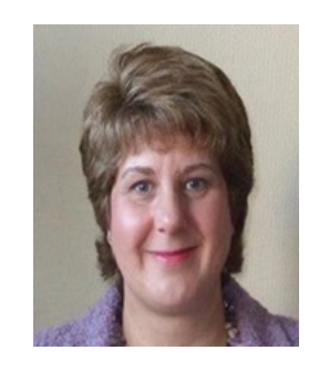
Chief Officer Education & Youth