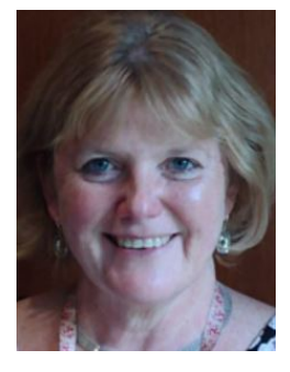
Cabinet Member for Education, Welsh Language, Leisure & Culture